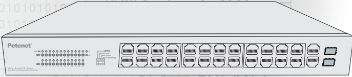
24-Port Gigabit Unmanaged PoE+ Switch